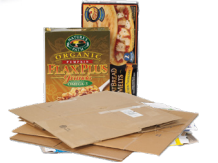
Cardboard & Boxboard