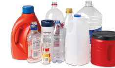
Plastic Bottles, Jugs & Jars