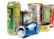
Aluminum & Steel Cans