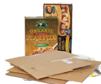
Cardboard & Boxboard