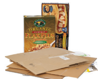
Clean Cardboard & Boxboard