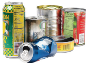
Clean and Dry Aluminum & Steel Cans