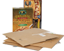
Cardboard & Boxboard